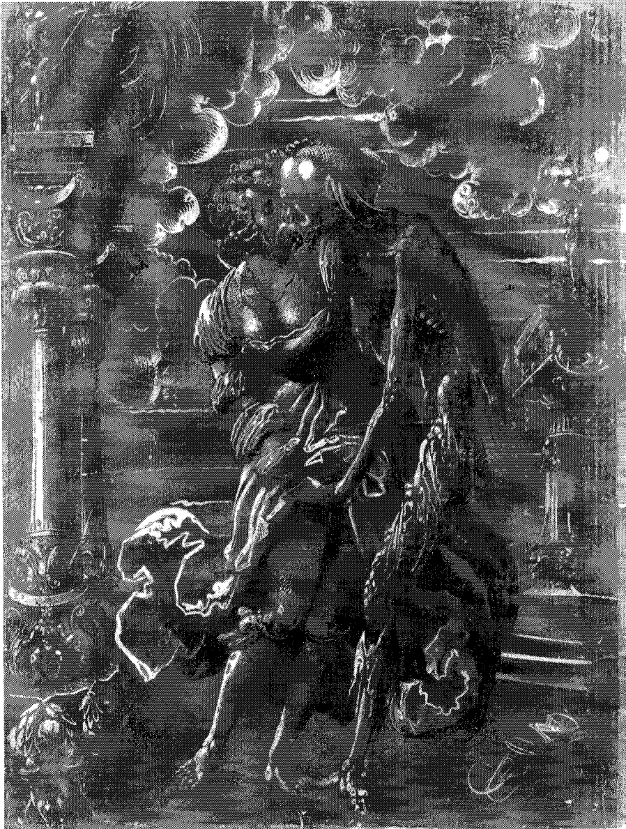
Niklaus Manuel Deutsch, Death as a Mercenary Embracing a Young Woman (1517). Varnished tempera on fir wood. Öffentliche Kunstsammlung Basel, Kunstmuseum.