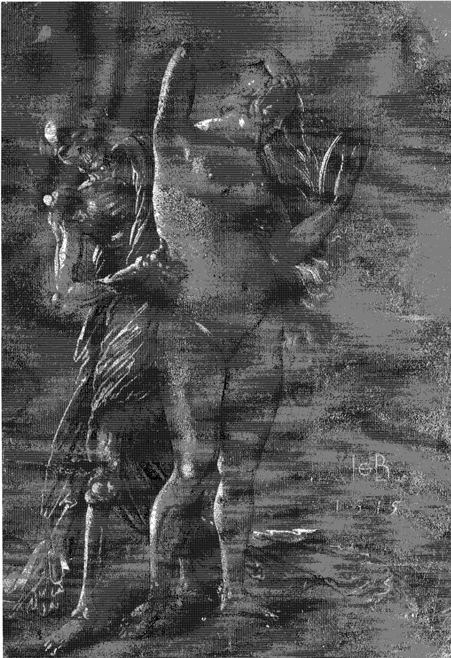
Hans Baldung, Der Tod und die Frau ( Death and the Woman) (1515). Kupferstichkabinett, Staatliche Museen zu Berlin-Preußischer Kulturbesitz, Berlin.