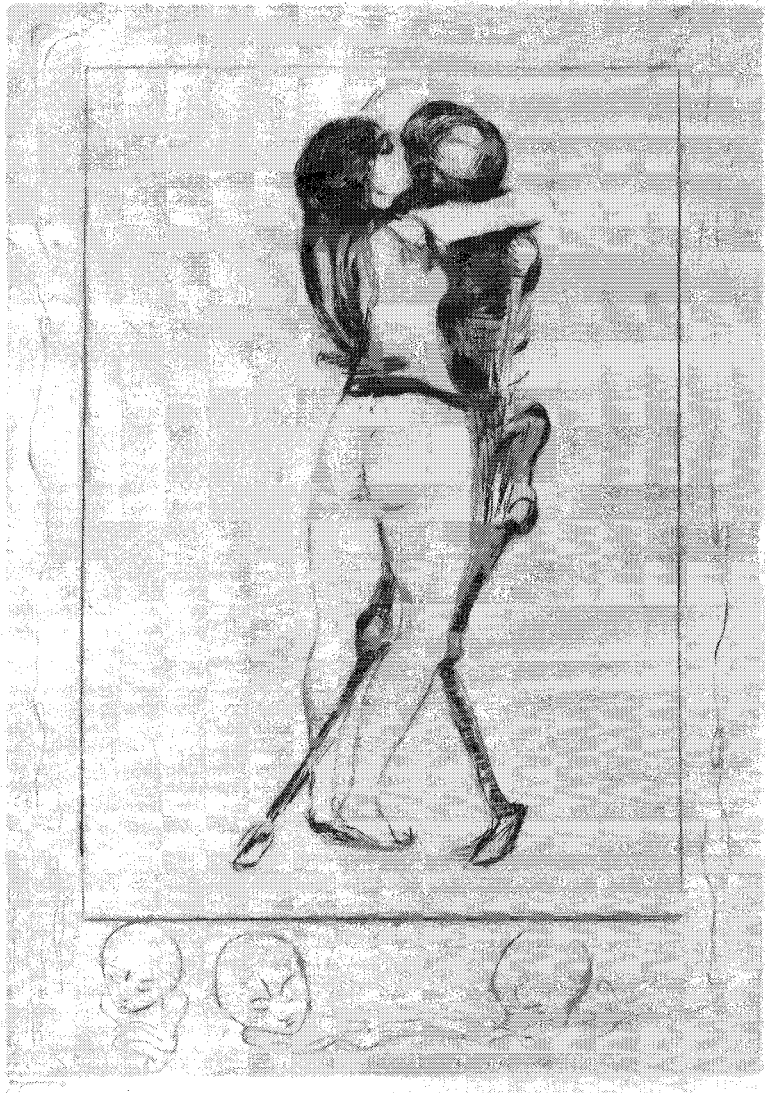
Edvard Munch, Death and the Maiden (1894). Intaglio print. Munch Museum, Oslo.